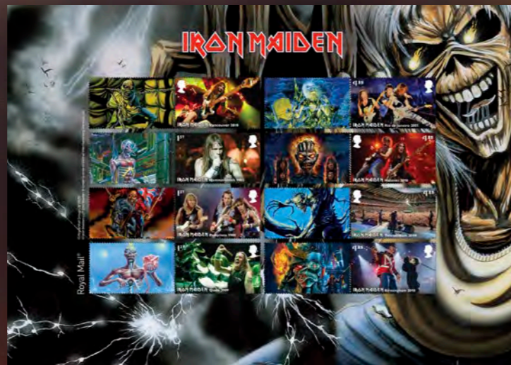
18 Eddie Collectors Sheet | AT142 £12.40