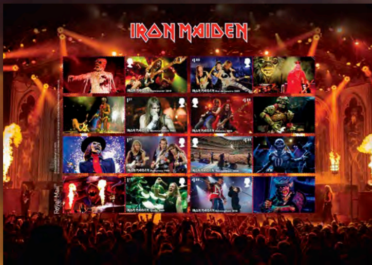
17 Live Performances Collectors Sheet | AT141 £12.40